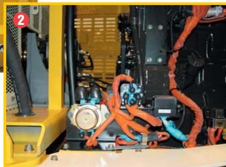
Photographs are representations only. Actual options will vary by model and application.