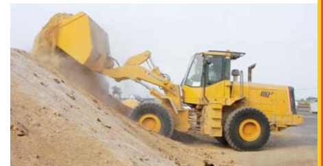
Photographs are representations only. Actual options will vary by model and application.